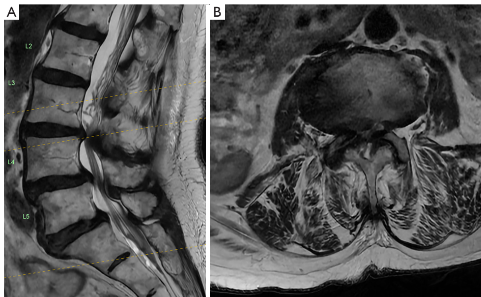
Figure 1 T2-weighted MRI showing the severity of our patient's LSS in August 2021. (A) It is a sagittal section showing stenosis at the L3/4 and L4/5 levels. (B) It is an axial section at the L3/4 level showing effacement of the CSF signal around the cauda equina. This represents grade D compression (extreme stenosis). MRI, magnetic resonance imaging; LSS, lumbar spinal stenosis; CSF, cerebrospinal fluid.

(5-8). Alongside this, gait patterns can provide insight into LSS disease severity, although routine evaluation of gait metrics is not a standardized measure of care. LSS patients with higher levels of pain and functional disability (as measured using patient-reported outcome measures) have worse spatiotemporal gait metrics and patients with higher radiological grades of stenosis demonstrate greater pelvic rigidity (9,10).